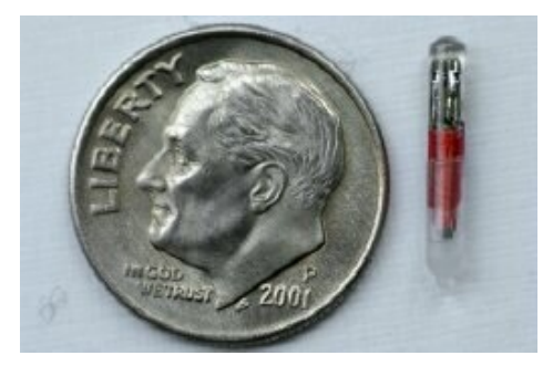
Dime and Verichip

VeriChip is expected to sell for about $200. A scanner used to read information contained in the chip would cost between $1000 and $3000. A doctor would insert the chip with a needle-like device."<sup>15</sup>