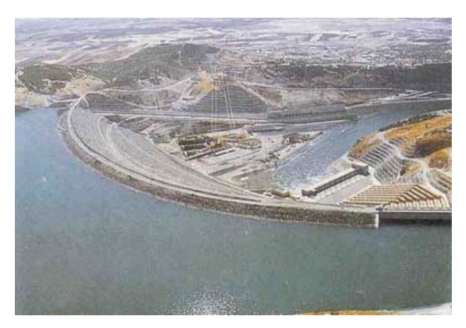
Ataturk Dam on the Euphrates River

What is the mechanism for drying up the deep and wide Euphrates River? Currently there are three major dams operational on the Turkish portion of the Euphrates River, the Keban, Karakaya, and the Ataturk. Two more, the Birecik and the Karakamis, are under construction.<sup>17</sup> In addition, Syria has built a dam on the Euphrates called the Tabqa Dam. It was built at the city of Tabqa, also called Thawra (Revolution).<sup>18</sup> It is estimated that Turkey contributes 89% of annual flow and Syria contributes 11% of the Euphrates River flow.<sup>19</sup> If Turkey shut off its dams on the Euphrates River, very little water would enter Syria, not to mention the possibility of Syria shutting off its Tabqa Dam as well. This would completely dry up that major Asian river, which would otherwise present a formidable barrier to any large army.