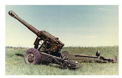
Towed Chinese Type 66, 152 mm Gun-Howitzer

Verse 19 says that the power of the "horses" was in their mouths and in their tails, the tails being like serpents, having heads with which they do harm. The tail of each "horse" is a towed artillery piece, the barrel of which has a bulbous flash-hider or muzzle brake at the end. All modern artillery has this characteristic.