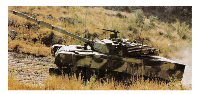
Chinese Type 90 Main Battle Tank

The description of the "horses" in the vision, upon which the men were riding, fit exactly the description of modern tanks. Tanks were the vehicles of choice for transporting soldiers of the Russian army in WWII when they pushed the German army back to Berlin. Russian tanks were so crowded with soldiers in this campaign, that some fell off and were crushed under the treads of the following tanks. Remember that the apostle John had never seen any vehicle other than horse-drawn chariots. To him, anything upon which men were riding was a large "horse".