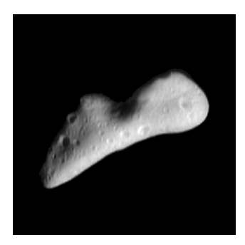
Asteroid Eros at 970 mile range

2<sup>nd</sup> Trumpet: Verses 8 and 9 suggest that the great mountain burning with fire is a huge asteroid from space which hits one of the three oceans with devastating force. The earth orbits the sun at a speed of about 67,000 miles per hour.<sup>7</sup> Even if the asteroid had no speed of its own, imagine our planet running into a mountain 10 miles wide at 67,000 miles per hour! The "mountain" seems to burn with fire as it hits the atmosphere, and the heat of friction at its edges is seen as fire. All the ships in the ocean that it strikes are destroyed by the monstrous waves generated by the impact, and all the sea creatures in that ocean are killed by the shock wave of the impact. The surface of the sea becomes red with their blood as their internal organs burst.