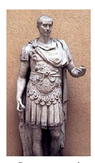
Caesar as general